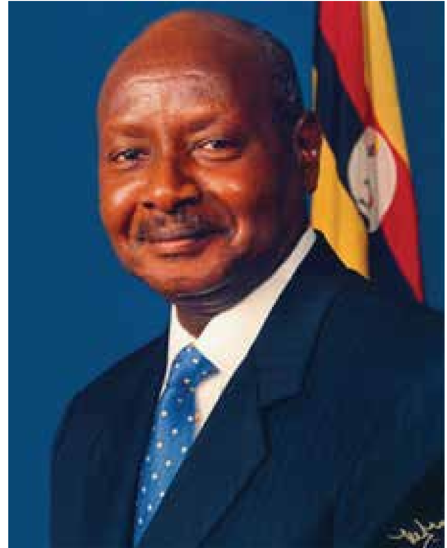
H.E. Gen. Y. K. Museveni The President of the Republic of Uganda