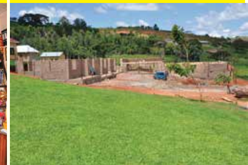
BAC SERVICES (IBANDA) LTD: Dealers in: General Stationary, Printing, text books, hiring Tents & Chairs. Tel: 0772-344053 or 0772-911287, Ibanda Municipality – High Street.