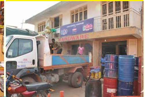
DUBAI IBANDA HARDWARE (Dealers in: building materials, cement, paint, iron sheets etc. main street, opposite shell Ibanda Municipality. Tel: 0782190616 or 0701190616.